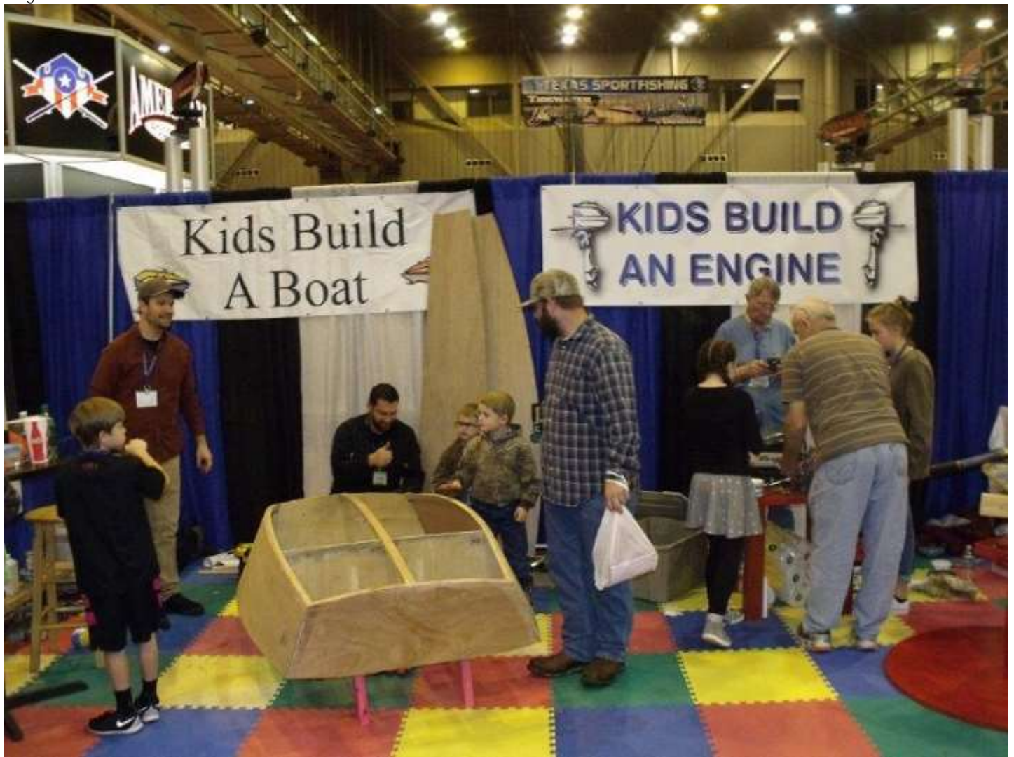
Kids Build a Boat & Engine