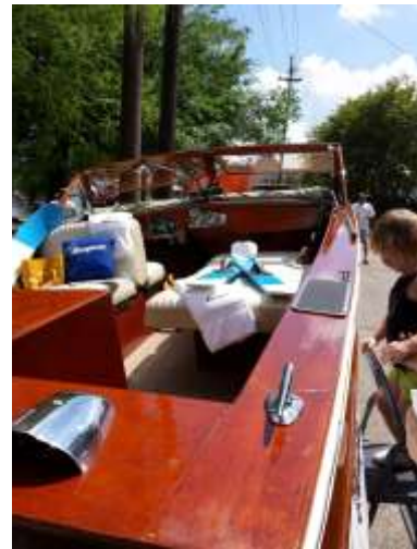
Tremendous variety of boats, music, and Cajun food to participate in at the festival.