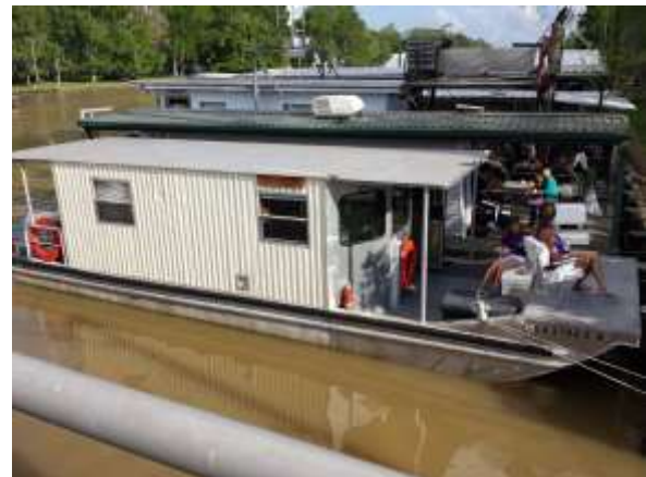
Above...the SS Fixed Income