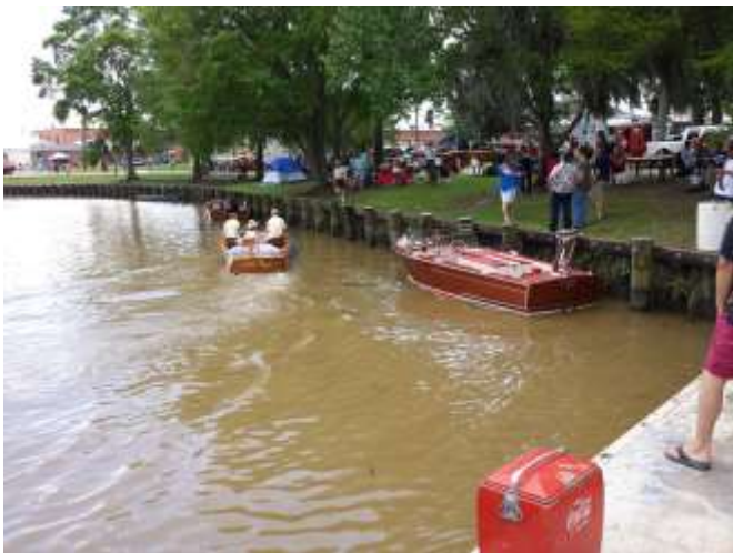
Scenes from the cruise destination at Franklin Louisiana