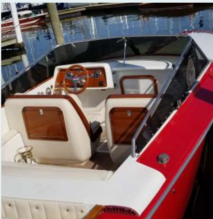
Left, luscious Fi-no 30. Right restored 17 foot Boston Whaler. The first Whaler in the area