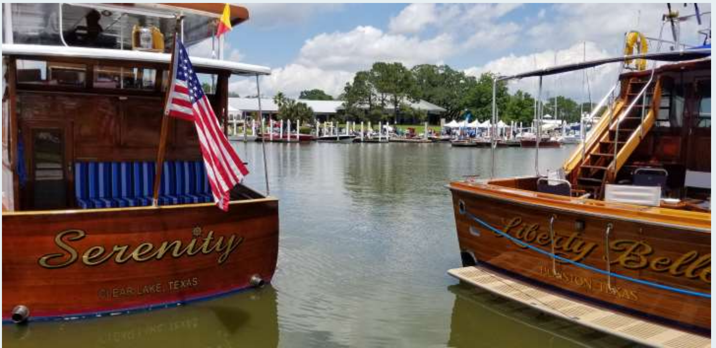
Bottom. Selling the sizzle in sizes to fit all!