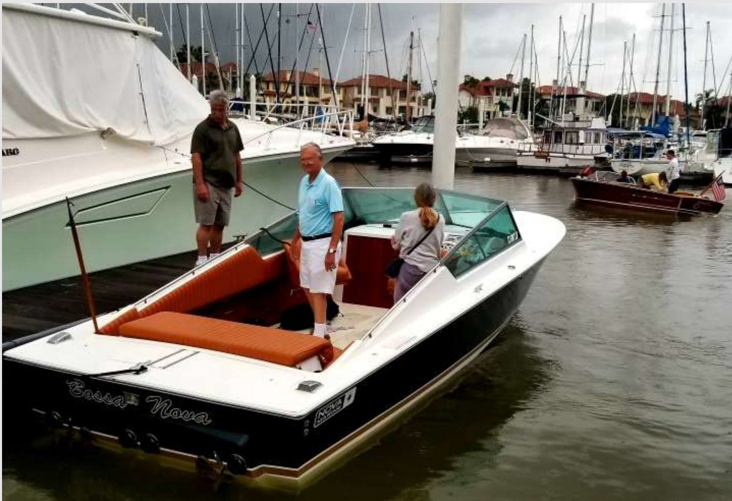
Above, Untying at the floating restaurant docks to depart. Ominous clouds in the background. Below, Revelers enroute.