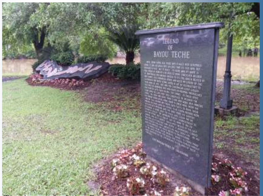
The Legend of the Bayou Teche is a snake so large it stretched from town to town. Boats locking in the many places. Keeping the rain out with a patriotic flair.