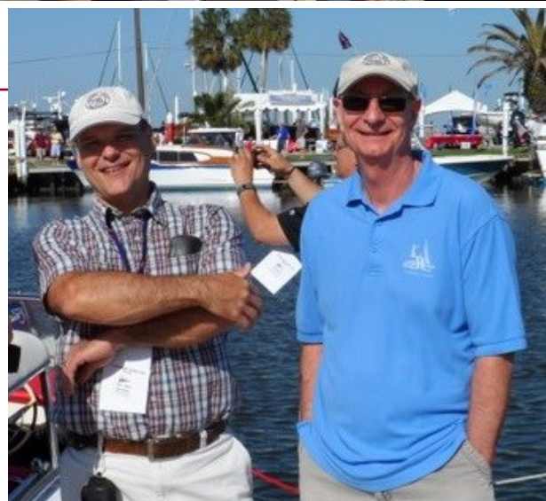
Club members and fellow enthusiasts enjoying the views.