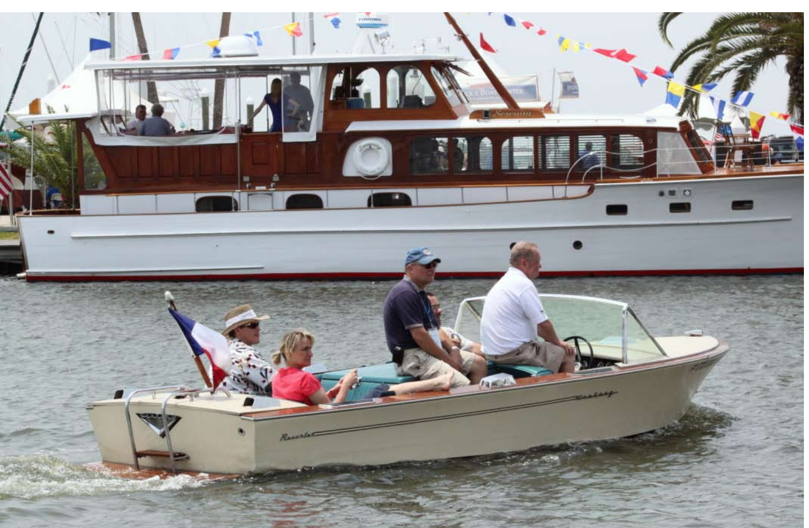
The Century Boat Club president navigating the inner harbour.