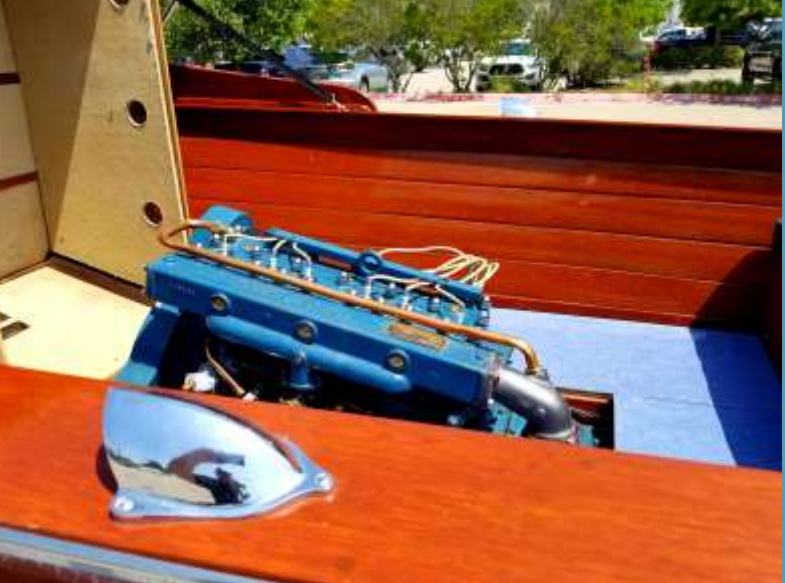
Beautiful pre-war Chris Craft 18 from Lake LBJ. Antique and vintage boats were exhibited on both land and water.