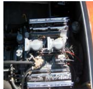
Ain't nuttin like a HEMI!

The show on Saturday was held at a new location this year, the Pier 121 Marina. There was ample dock space and the facilities included a covered outdoor bar and grill. As you can see in some of the photos, there was a good representation of Classic Glass in addition to wood. The Ride N' Show format gives members an opportunity to use their boats all day Saturday and Sunday morning.