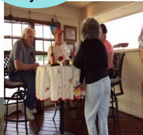
Saturday night in the boat house!