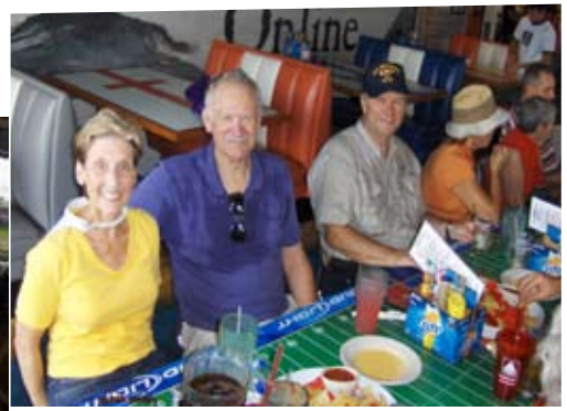
Wet and ready for the second half of the day.