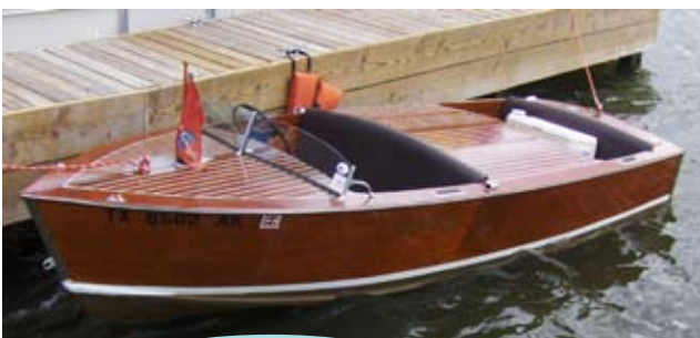
Unique late '50's Chris.