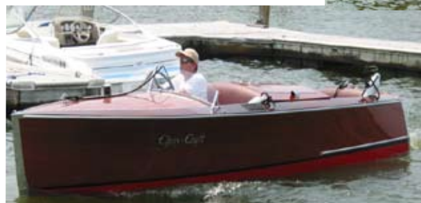
What a sweet boat!