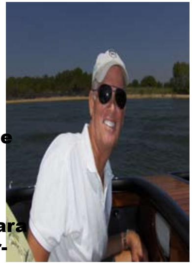
Taking delivery of his new Gar Wood!