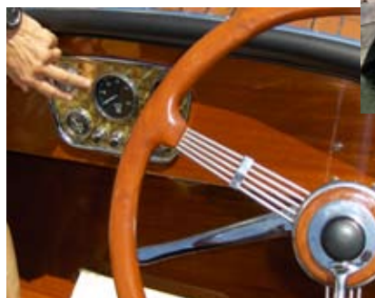
Beautiful turned brass dash.