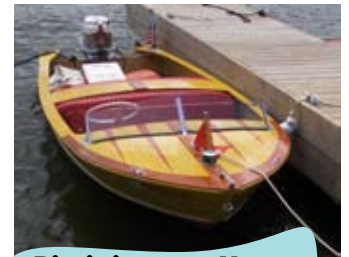
Biminis were the rage!