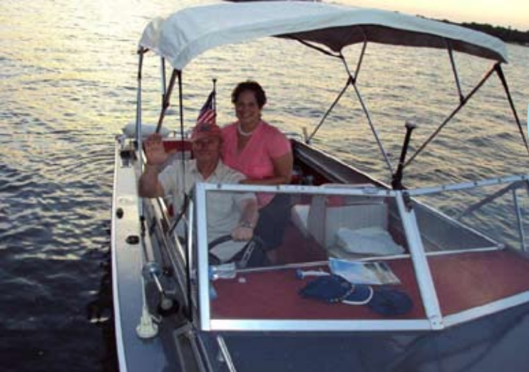
Departing from home in their cruiser.